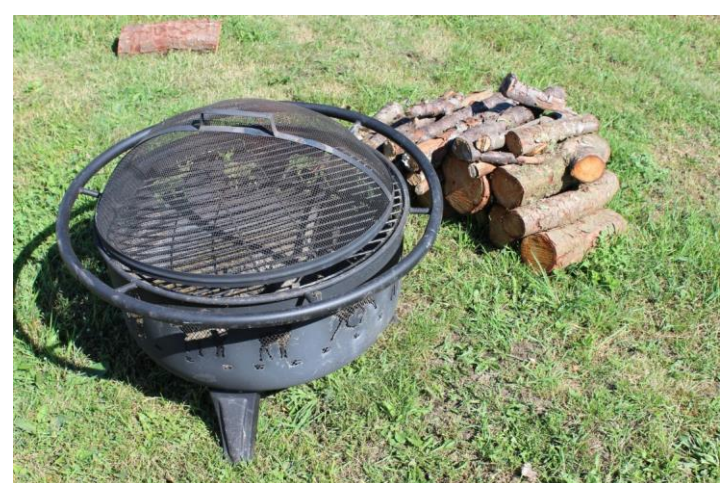
Lighting Package (included)